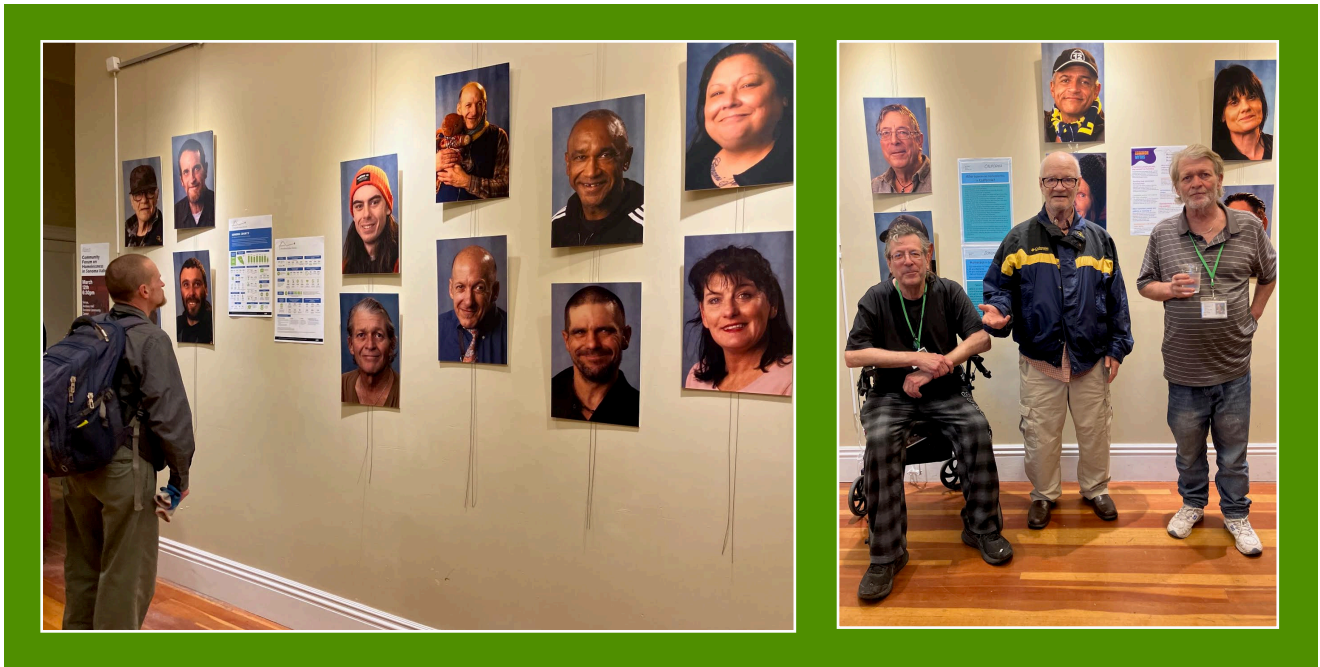
Sonoma Community Center Unveils "Invisible Neighbors" Exhibit, cosponsored by HAS, to address homelessness

“ I hope my artwork will help dispel many of the misunderstandings that people have of the homeless ”